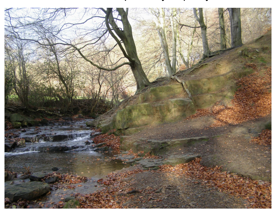
Waterfall where the beck crosses the more resistant rock

Clifton Rock sandstone forms this cliff, which was probably a quarry.