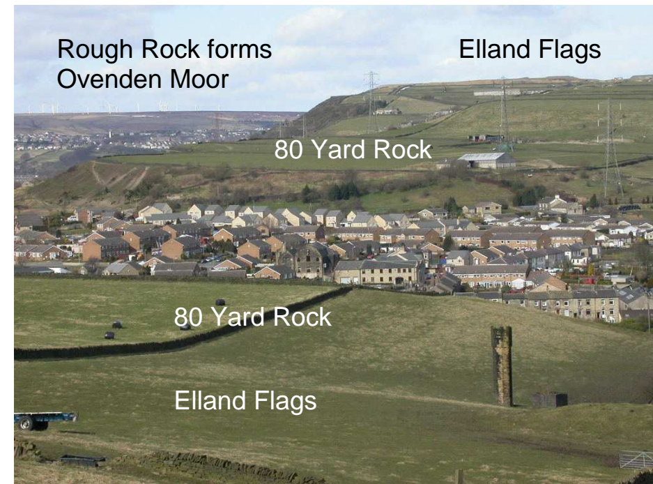
View to north from Beacon Hill

If you want to find out more about the West Yorkshire Geology Trust contact team@wyorksgeologytrust or look at our website www.wyorksgeologytrust.org