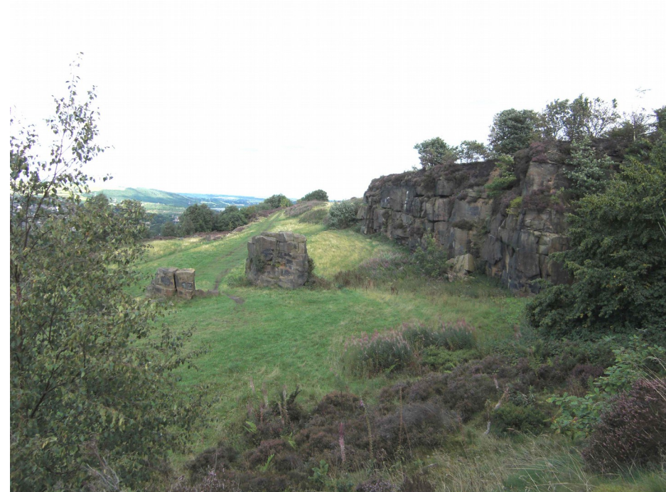
Bedding planes and joints in the Rough Rock at one of the Eaves Top Quarries

If you want to find out more about the West Yorkshire Geology Trust contact team@wyorksgeologytrust or look at our website www.wyorksgeologytrust.org