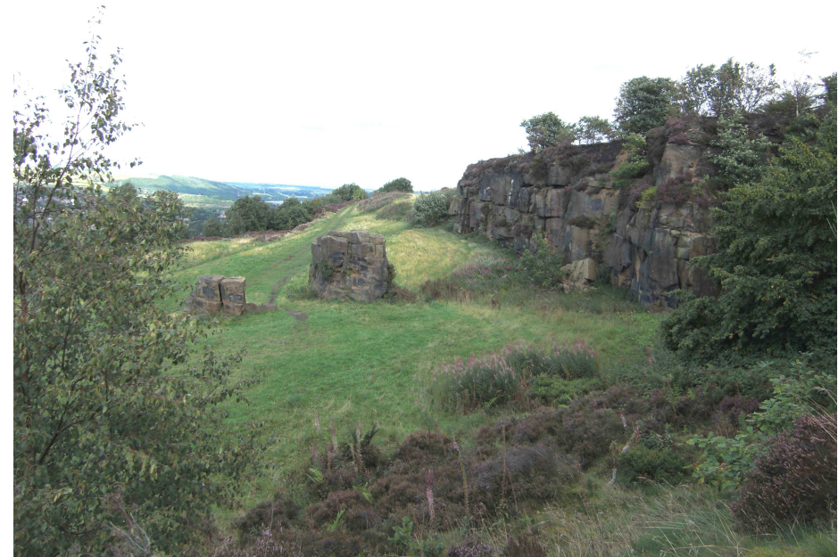
Bedding planes and joints in the Rough Rock at one of the Eaves Top Quarries

If you want to find out more about the West Yorkshire Geology Trust contact team@wyorksgeologytrust or look at our website www.wyorksgeologytrust.org